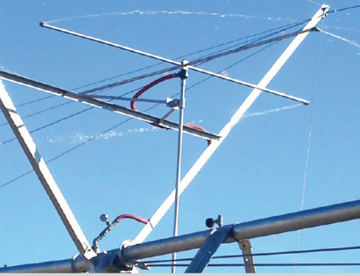
Low water pressure operation