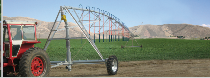
Zimmatic quality available in towable and non-towable options